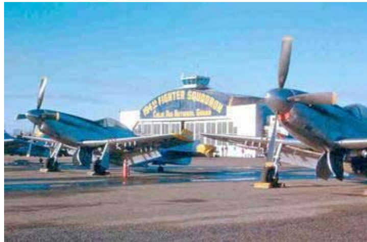
P51's of the 194th Fighter Squadron at Hayward ANG Base