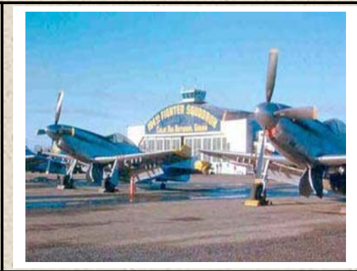
Hayward ANGS 1951

We will celebrate with a Unit Transition Ceremony and a farewell party inside the Historic Hayward Hangar at 1525 West Winton Avenue in Hayward 9 September 2007